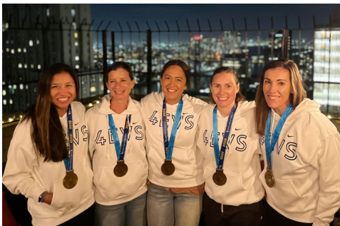
Runners representing the National CMV Foundation in the 2022 TCS NYC Marathon